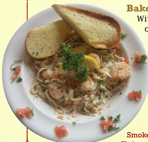
Smoked Salmon & Shrimp Linguine

With sweet peppers, and onions in a spicy tomato herb sauce. $12